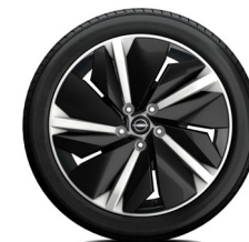
19" Aero 2Tone Alloy Wheels