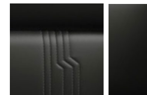
Black Synthetic Leather