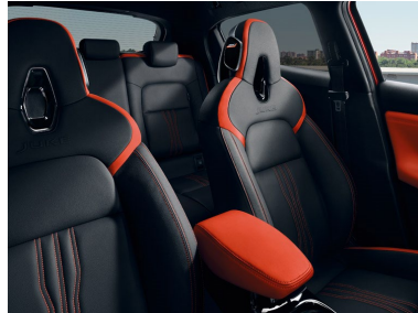
ORANGE INTERIOR PACK