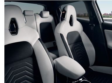
GREY INTERIOR PACK