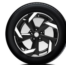
17" black + diamond cut alloy wheel