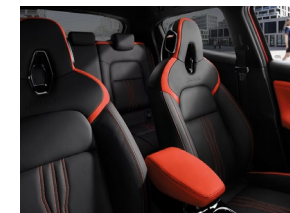
Optional Orange Interior Pack *See SV Premium for standard N DESIGN trim