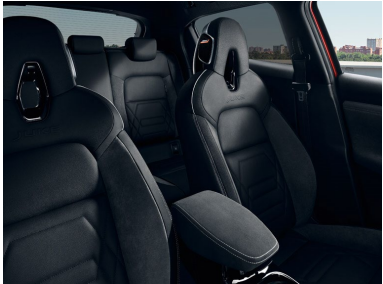
BLACK INTERIOR PACK