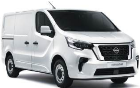
White Glacier - S WHI