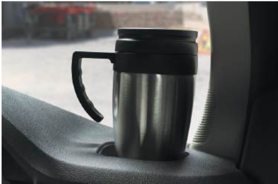
Convenient cup holder to safely hold your beverage*