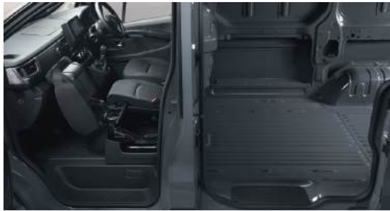
A 1.0m wide sliding door is available for one or both sides.