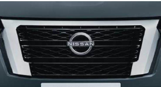
Distinctive Interlock-grille design