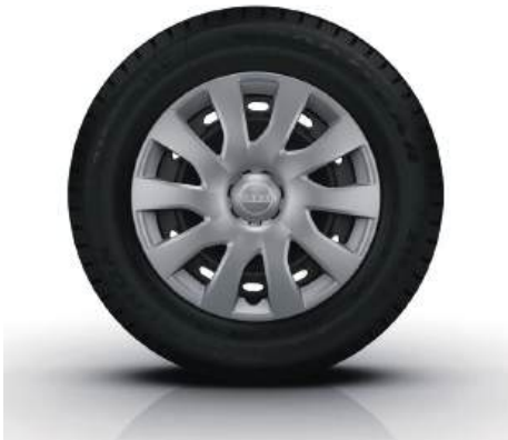
16" Wheel Cover Standard SV Premium