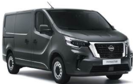
Grey Comete - M GCM