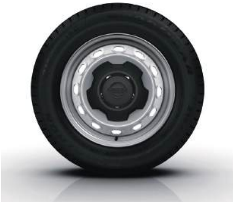
16" Steel wheel Standard SV