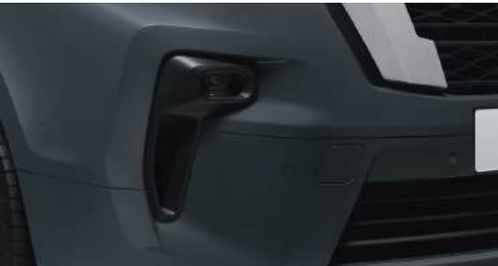
Side vents with LED fog lamps