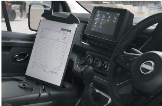
Mobile Office functionality*