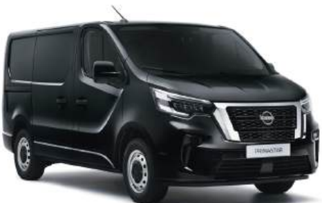
Black Midnight - S BLK