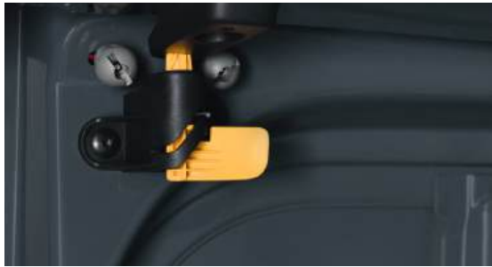
This clever device lets you lock a rear door open