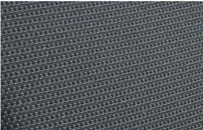
Basic Trim Standard