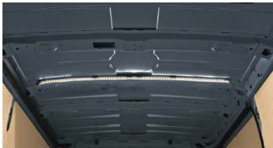
Optional bright LED lighting makes it easier to work in the load space.

Nissan Primastar is ready to take on any task. With a best-in-market length capacity of 4.15 meters and rear doors that open up to 180°, it can tackle even the biggest jobs. Add clever storage tools and, depending on configuration, a maximum load volume between 3.2 to 8.9m³ and you have one highly versatile and accomodating load space.