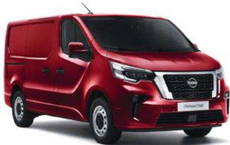
Red Carmin - M RCM