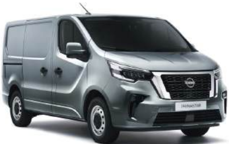
Grey Highlands - M GHG