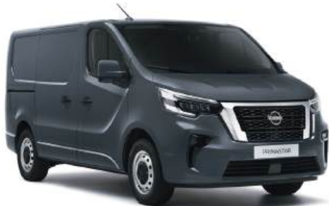
Grey Urban - S GRU