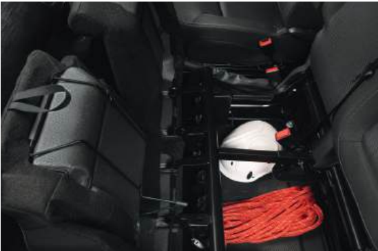
54 litres of storage beneath the passenger seats*

With smart connectivity, 90 litres of storage space and foldable passenger seats that create a useful work table, Nissan Primastar becomes your office on the road. Its car-like interior with satin chrome switches and high quality seat upholstery create a relaxed and comfortable space for a refined drive.