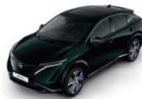
Aurora Green -M- DAP