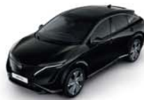
Pearl Black -P- GAT