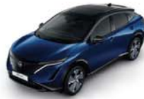
Blue Pearl -P- XGU