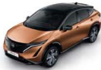
Akatsuki Copper -M- XGJ