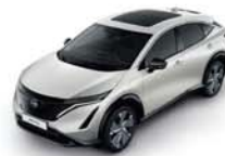
White Pearl -P- QBE