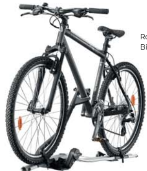
Roof Mounted Bike Carrier

Choose from a wide range of accessories to enhance your style and protect ARIYA. From Towbar to Styling items, Exclusive Mats and much more to emphasise ARIYA unique design and even more extend a luxury feeling.