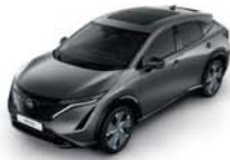
Gun Metallic -M- KAD