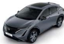
Ceramic Grey -P- KBY