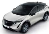
White Pearl -P- XGA