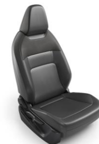
Standard: Black Synthetic Leather & Cloth