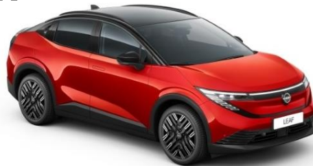
FUJI SUNSET RED