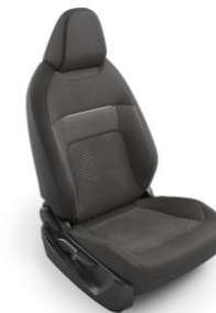
Standard: Dark Cloth