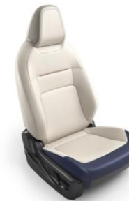
Option: Light Synthetic Leather with Dark Blue finish