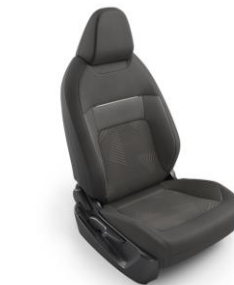
Standard: Dark Cloth