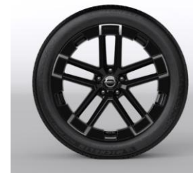
20" NISMO Alloys