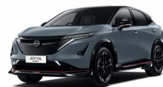
STEALTH GREY & BLACK ROOF