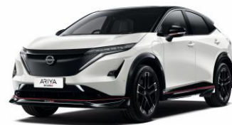
WHITE PEARL & BLACK ROOF