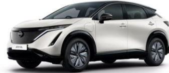
TWO TONE PEARL