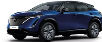
TWO TONE PEARL