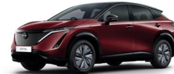
TWO TONE PEARL