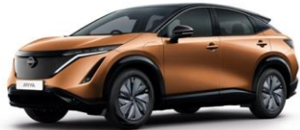
TWO TONE METALLIC