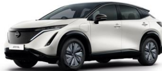
TWO TONE PEARL