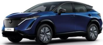
TWO TONE PEARL