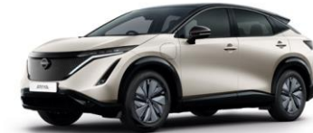
TWO TONE METALLIC