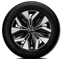
17" Flex Wheels