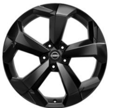
19" Black SVE Alloys