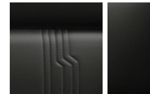
Black Synthetic Leather