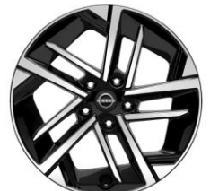
17" Diamond Cut Alloys