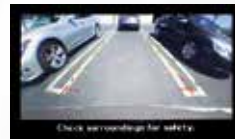
Rear View Camera This system will help you to expand your field of vision when driving in reverse.

Electronic Brake Distribution (EBD) sends extra force to the rear brakes when you have additional weight of passengers or cargo in the back.