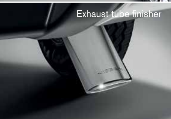
Exhaust tube finisher