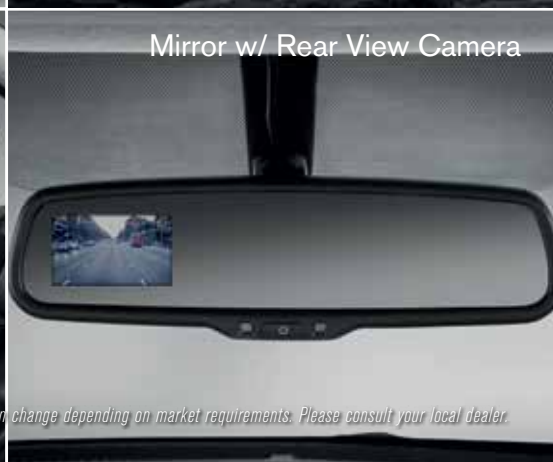
Mirror w/ Rear View Camera