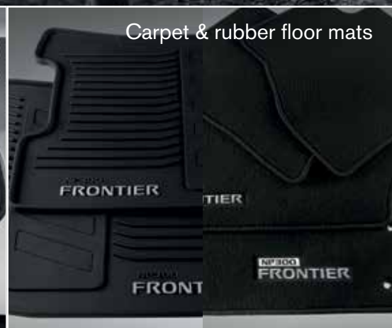
Carpet & rubber floor mats