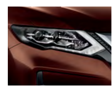
Dark Brown - P - CAS