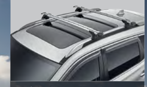
Roof Bars (Through Style) Attractive and practical Roof Bars with a sleek finish and maximum carrying capacity of 80kg.