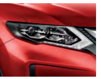
Tinted Red - CP - NBF