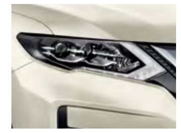
White - 3P - QAB