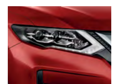
Red - S - AX6