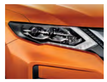
Orange - PM - EBB