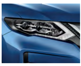
Blue - PM - RAW