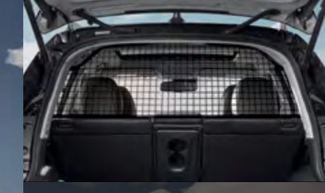
Cargo Barrier Cargo Barrier protects vehicle occupants from any loose items during sudden braking. Maximum load mass of 60kg.