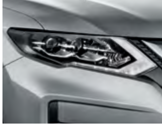
Silver - M - K23