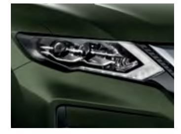
Military Green - PM - EAN