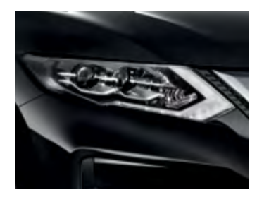
Black - P - G41