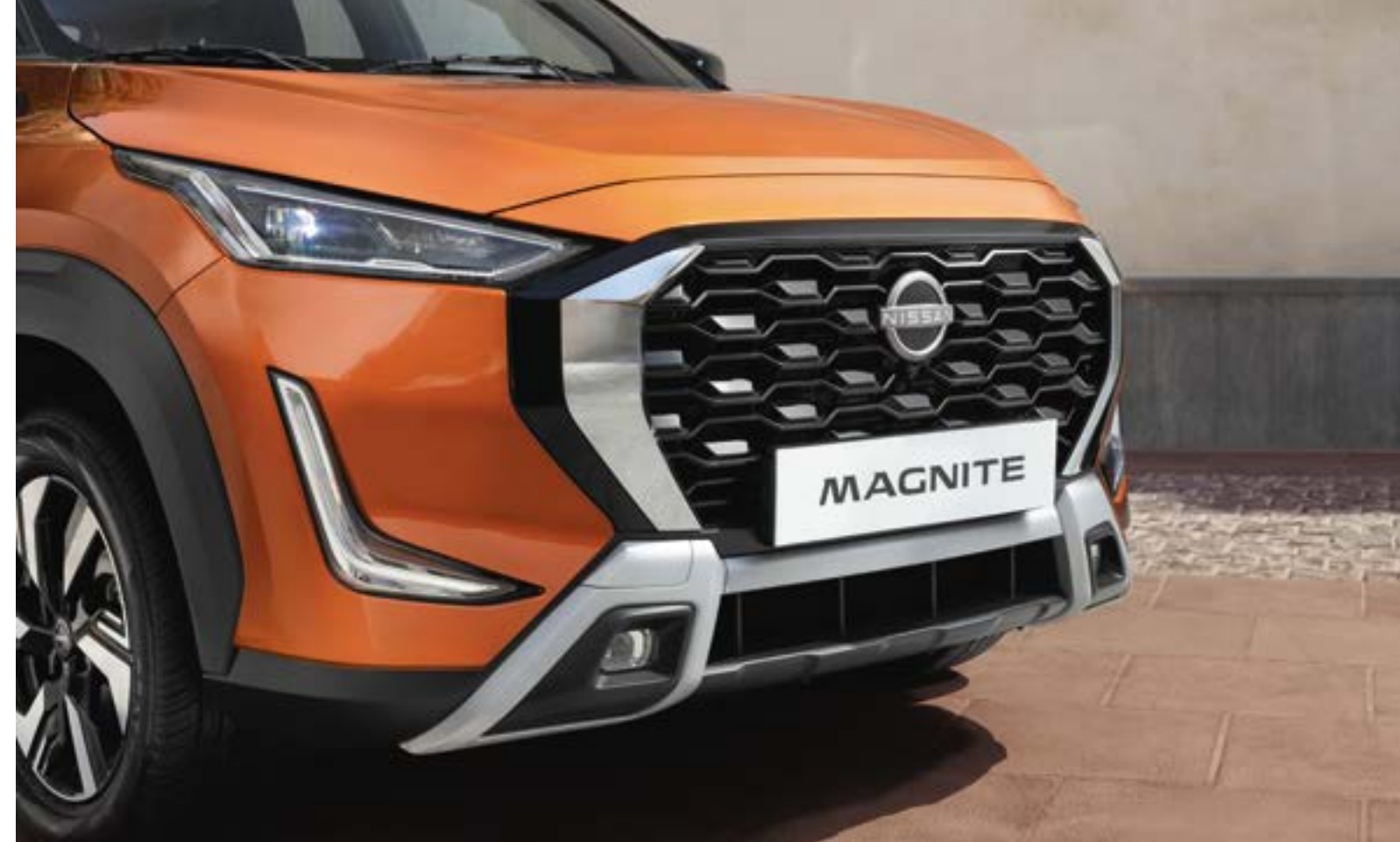
Imposing Grille with Dual Tone Finish & Floating Skid Plate