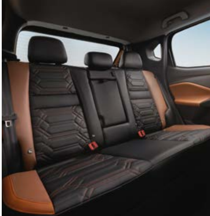
Back Seat Knee Room

Make the back seat experience an enjoyable experience, every time. The 219mm knee room also ensures easier entry and exit, and comfortable seating, even during long drives.