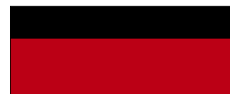
Flare Garnet Red & Onyx Black SV | SL+