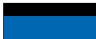
Vivid Blue & Onyx Black SV | SL+