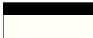
Pearl White & Onyx Black SV | SL+