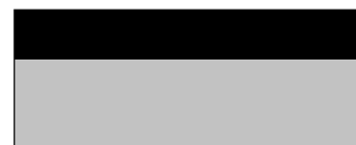
Blade Silver & Onyx Black SV | SL+