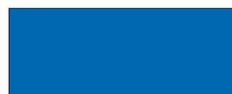
Vivid Blue S | SV | SL+