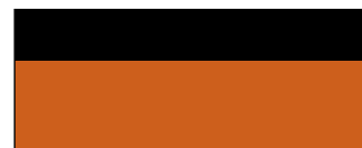
Sunrise Copper Orange & Onyx Black SV | SL+