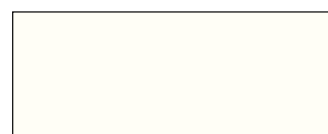
Pearl White S | SV | SL+ | Kuro