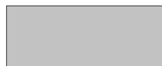
Blade Silver S | SV | SL+