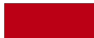
Flare Garnet Red S | SV | SL+ | Kuro