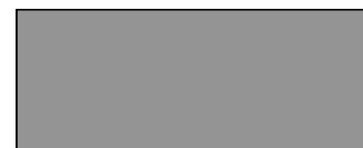
Metallic Grey S | SV | SL+ | Kuro